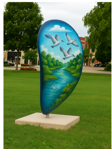
Example: Murals vary by location & artist design