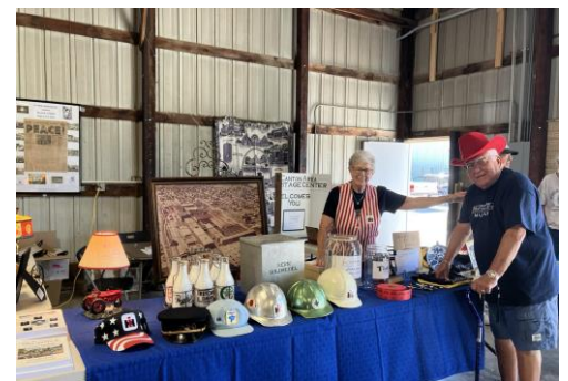
Traveling Museum at Fulton County Bicentennial September 3, 2023

Plattensburg Apothecary Cabinet/Original Boxes of Medicinal Herbs