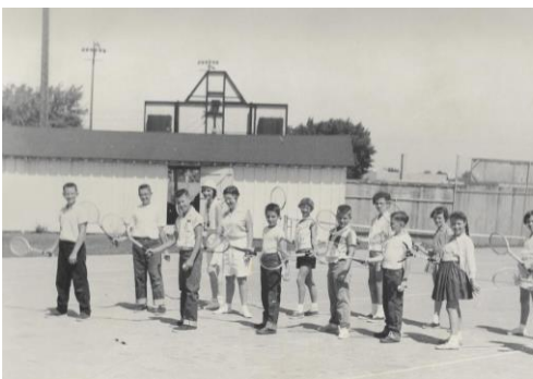
Canton Park District 100 th Anniversary Photos Display

New museum exhibits coordinated with the Acquisitions and Programs Committees this year included: