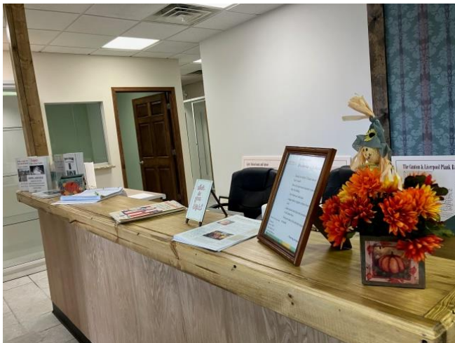
New Welcome Desk