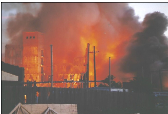
Buildings totally engulfed in flames at the abandoned International Harvester Plant in Canton, August 6, 1997.