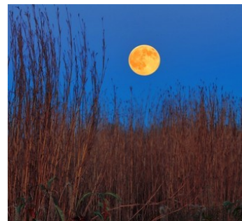
The Hunter's Moon