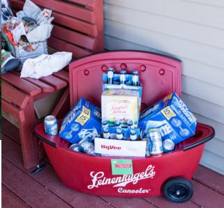
WINNING TEAM Town & Country Insurance Agency, Ltd.