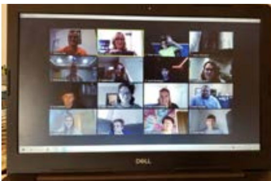
Workshop with the sophomores via Zoom