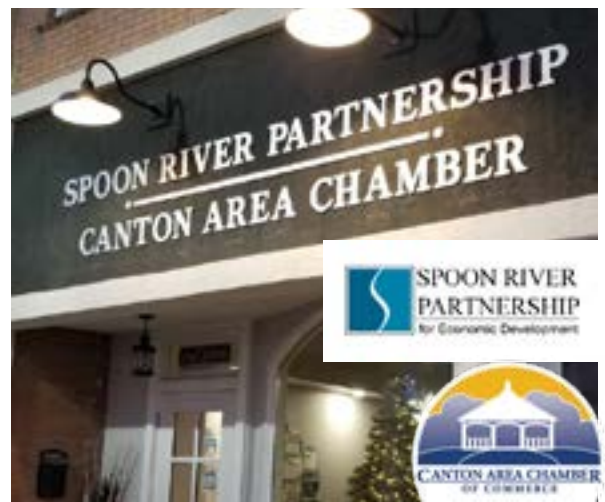
Located at 48 N. Main Street Downtown