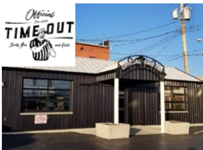
Located at the corner of Elm and 1st Avenue Canton

Official Time Out already had an outdoor area to sit in the summer months, but they decided to increase that space with a new building on the back side of their current location. This outdoor area can be used all year round with heat in the winter months and open air windows in the warmer months. Official Time Out is owned and operated by Billy Jump who continues to invest time and money into business. They are a great pre-game party place and offer great food in a sports bar atmosphere that is family friendly. Stop in for lunch or dinner or plan a party in one of their unique spaces. Contact them at 309-647-6553 or connect on their Facebook page at Official Time Out .