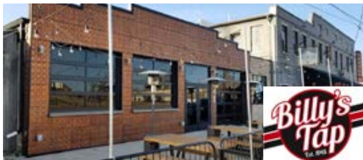
Located at the corner of Elm and 2nd Avenue, Canton

This new space is available for rent for your next party, celebration or family event. Find out more details by visiting their website at www.Billystap.com , Facebook page at Billy's Tap or give them a call at 309-647-9639.