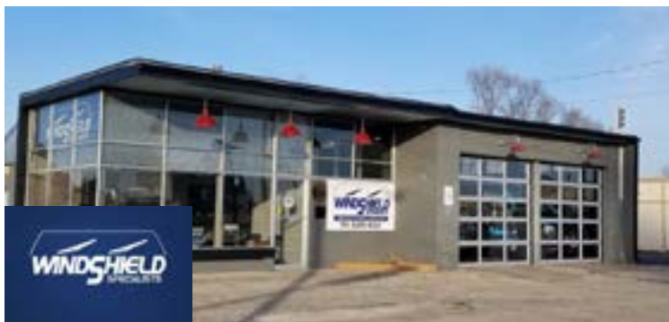
Located at 201 E. Elm Street in Canton

Windshield Specialists gave their current location a much needed improvement with some new paint, windows (they do specialize in glass!) and fun lights. They have been in several locations in Canton through the years, but this location they were able to really invest in the look of their business. Windshield Specialists has been serving central Illinois communities for over 20 years. They offer windshield replacement and repairs and also specialize in glass services such as shower doors, store front windows, mirrors and more. Contact Windshield Specialists in Canton at 309-649-1550 or check out their website at www.windshieldspecialistsil.com .