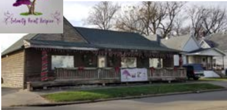
Located at 762 E. Chestnut Street in Canton

Serenity Point Hospice, LLC moved into a new office location and now they have plenty of room. Serenity Point Hospice group strives to provide excellent care for individuals of all ages and in all stages of life. Their goal is to help maintain the highest quality of life in the comfort of your own home. There are many questions when it comes to hospice care so reach out to Serenity Point by calling 309-435-7050 or email at serenitypointhospicellc@gmail.com or check into their website or Facebook page at www.Serenity Point Hospice