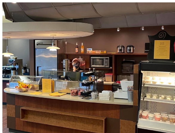
Big Cat's Bowls - Graham Clinic Location

Go ahead and swing by their new location to grab a meal or two, and be sure to follow them on Facebook (@bigcatsbowls) to stay in the loop!