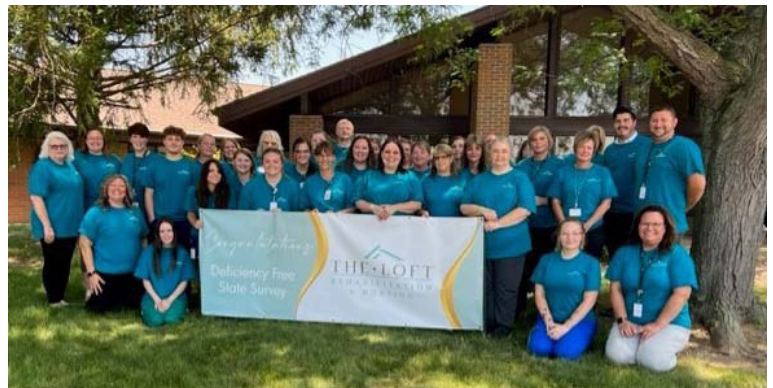
The Staff at the Loft in Canton

The Loft of Canton, a family owned and operated skilled nursing facility located at 2081 N Main St. between Farm King and Walmart, celebrated a mark of excellence recently - a deficiency-free annual survey by the Illinois Department of Public Health. Per medicare.gov data, the average number of deficiencies in the state of Illinois is 12.2 and the U.S. average is 8.9. When a facility receives a deficiency free state survey, it means you or your loved one can expect the highest level of care in an optimum environment, which is important when choosing short-term rehab or long-term care.