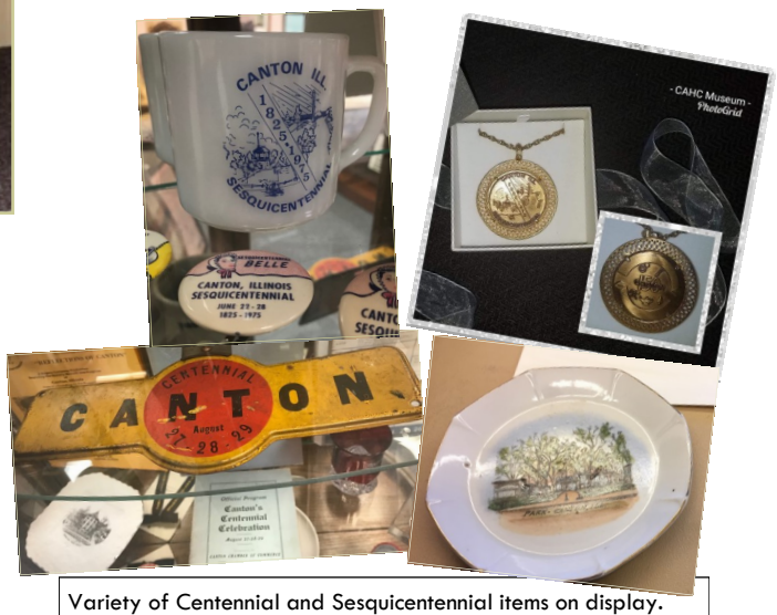
Variety of Centennial and Sesquicentennial items on display.

In addition to the exhibits just described, as you make your way through the museum, you'll find many other artifacts and small displays portraying the intriguing and totally unique heritage of the Canton area.